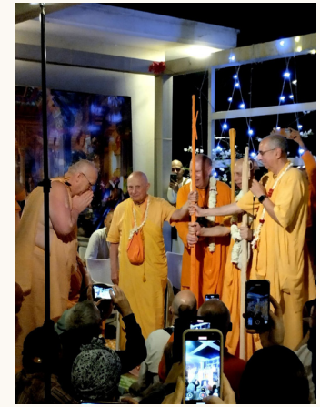
Visvavasv Swami Maharaja